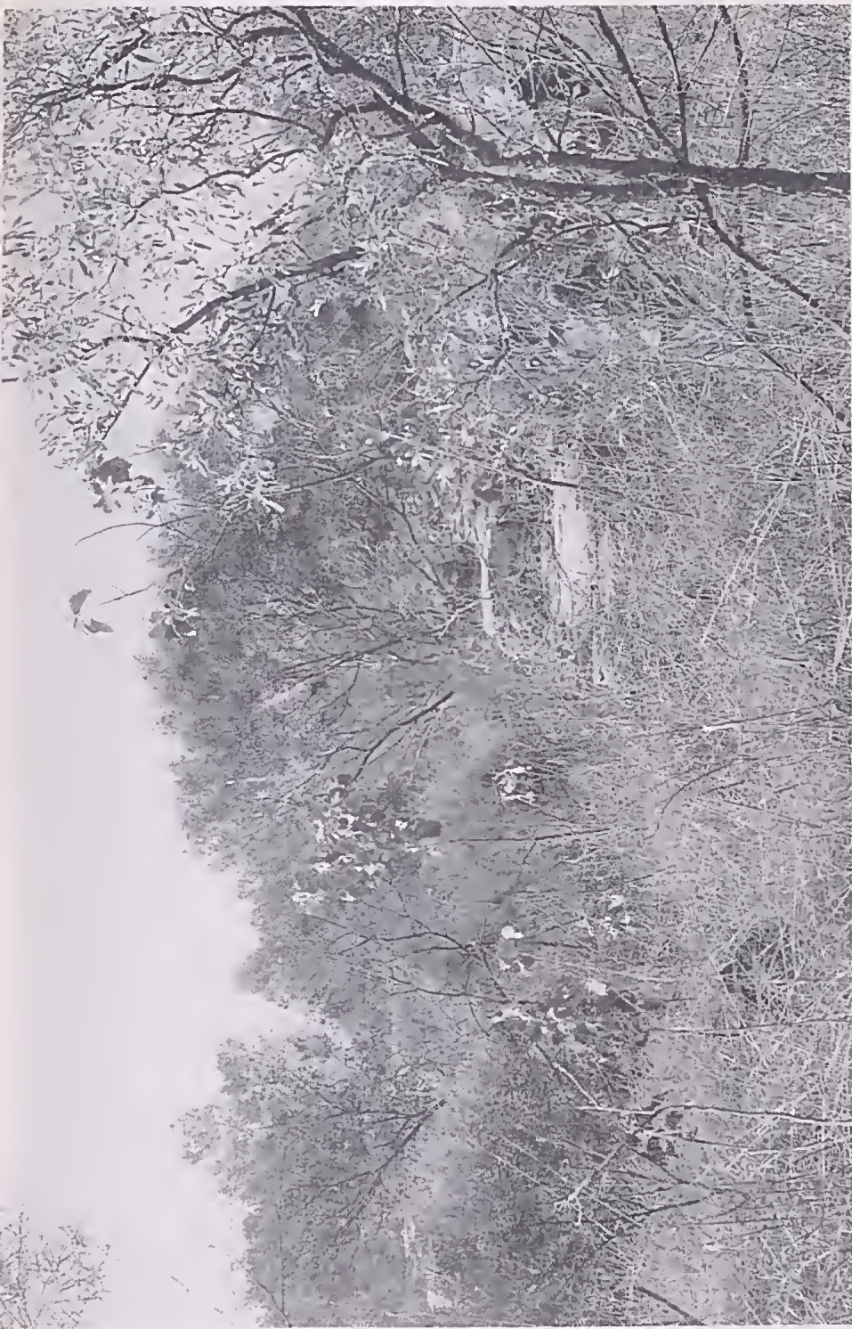
Figure 7. Acacia gonocarpa community on sandstone, West Governor Island.